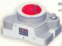
MANOK plus with clamping head