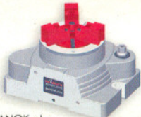
MANOK plus with jaw-adapter