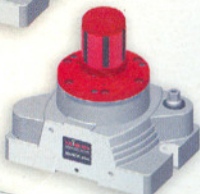
MANOK plus with MANDO Adapt